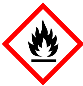
Highly / Extremely flammable