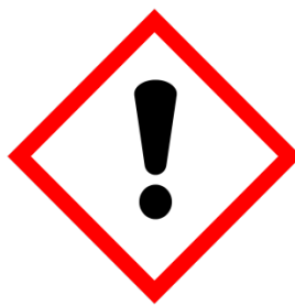
Dangerous to health