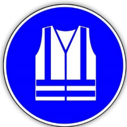
High visibility vest