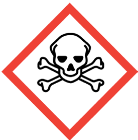
Toxic / Highly toxic