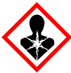
Harmful to health